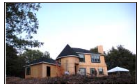
My new residence, under construction summer, 2006

♦ Do yourself a favor and be certain to actually check references on your contractor - The State of California oversees the legality of the construction industry and you