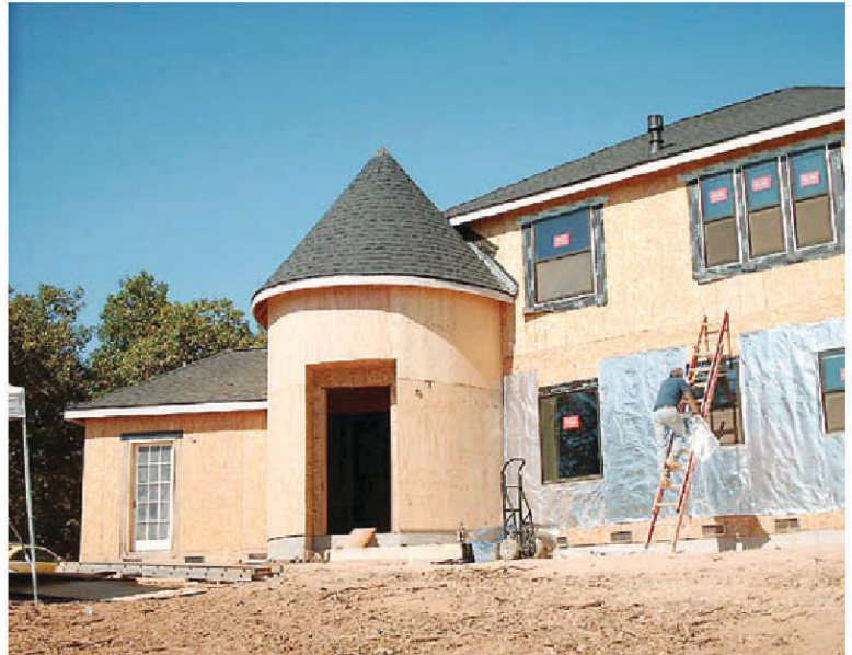
My hubby, Thomas Kehrlein, installing radiant barrier for our home in Grass Valley. Within 30 minutes of its summertime installation, the temperature in the kitchen dropped a full 10 degrees. The material was also utilized on our home's subfloors (first floor).

Cotton building insulation (Ultra Soft) - Would you believe recycled jeans make a fabulous insulating material? While it does cost appx. 50% more than fiberglass insulation, environmental engineers say this recycled, natural product