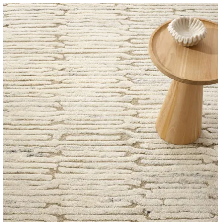
Malone Oatmeal Tufted Wool Rug

These elongated curtain panels create the illusion of a taller room. Ideal for white or cream-colored interiors, they add a touch of sophistication. Choose black for darker rooms and enjoy the transformative effect.