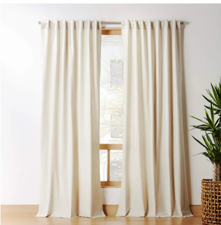
Natural Tan Cotton Basketweave Window Curtain Panel

While maintaining a singular color palette achieves this, Artem Kropovinsky , founder of Arsign, a NY-based interior design studio, favors a lighter one for its ability to brighten the room and create the illusion of a more expansive space.