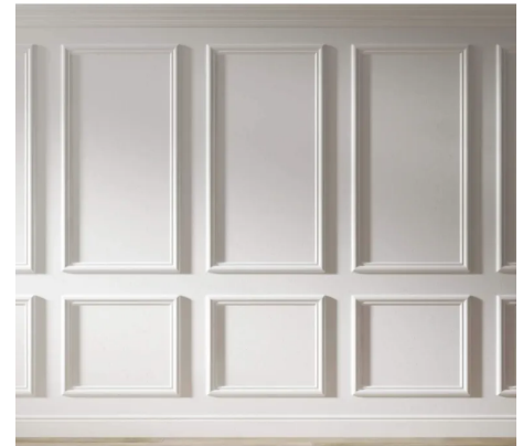
Ashford Molded Classic Wainscot Wall Panel (16"W x 28"H x 1/2"P)

According to Sam, low contrast is the key to maximizing small spaces. This is one of the best rugs , with its subtle design, provides compelling visual interest without overwhelming.