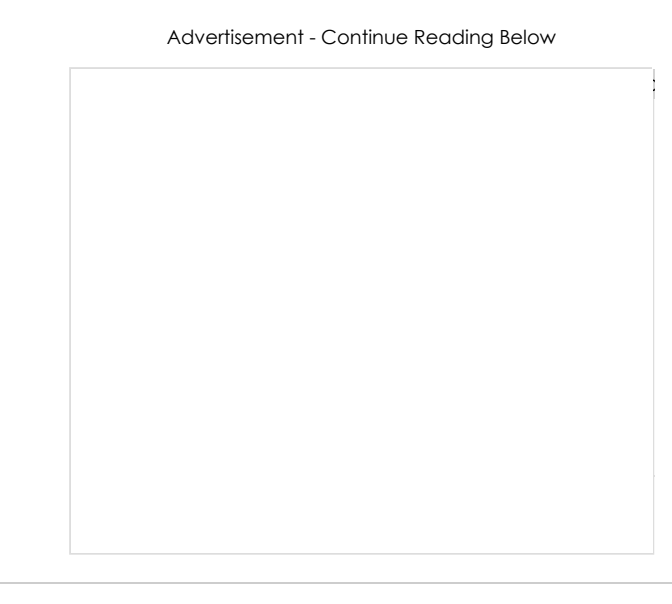
The Best Ways to Spend Your Time in Quarantine